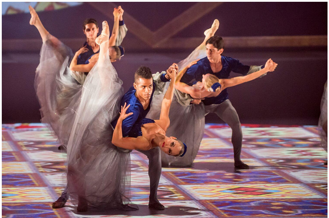
Grace on show