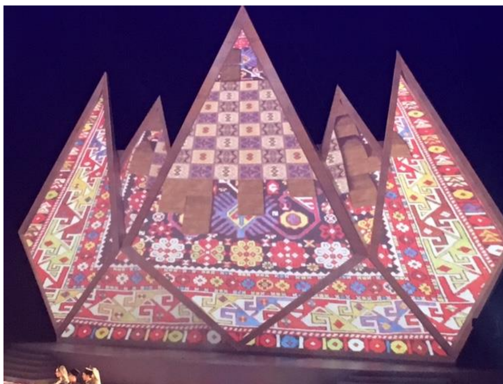
Beautiful display during the ceremony.