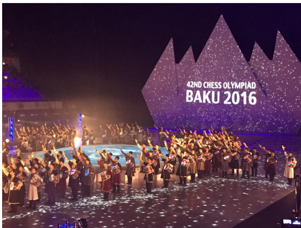
The opening ceremony in its glory.

The country's President Ilham Aliyev , who later declared the games open, led the applause from the audience represented chiefly by players and delegates from the approximately one hundred and eighty countries present.