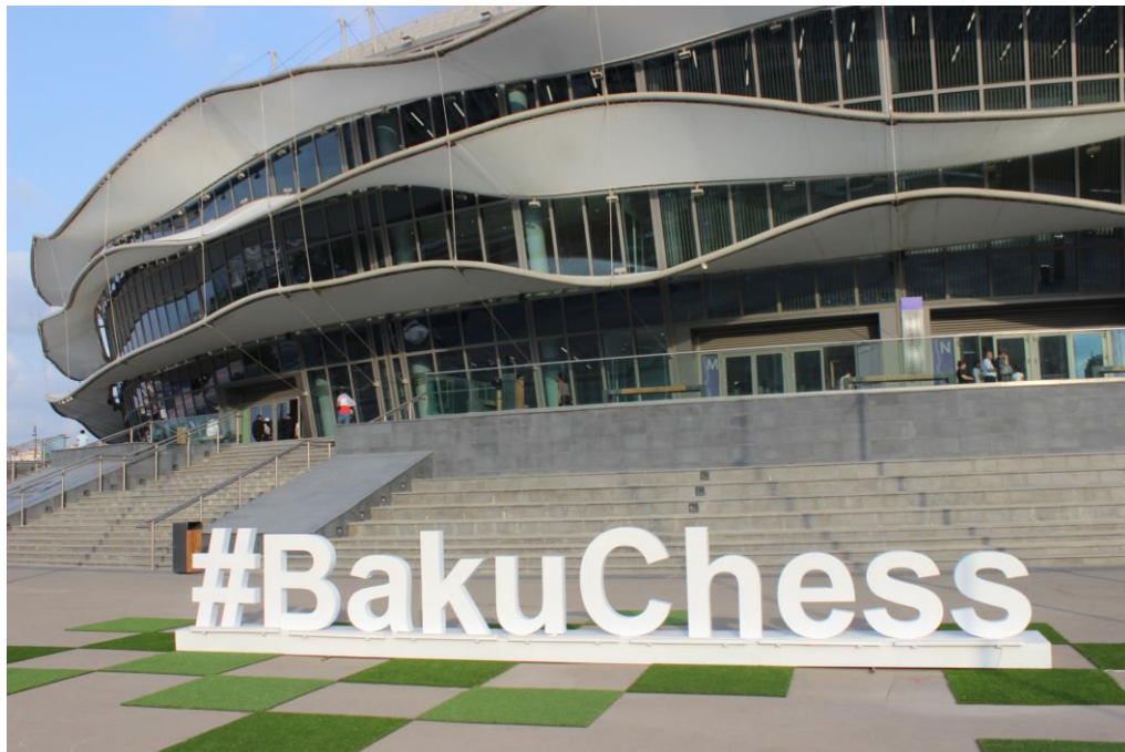
National Gymnastics Arena – site of Opening Ceremony.

The host country, Azerbaijan, staged a fabulous opening ceremony which began just after 7:00 pm on Thursday, September 1 at the National Gymnastics Arena. There was variety, the performances involving acrobatics, music, dance and impressive graphics highlighting, understandably, the chess pieces and themes.