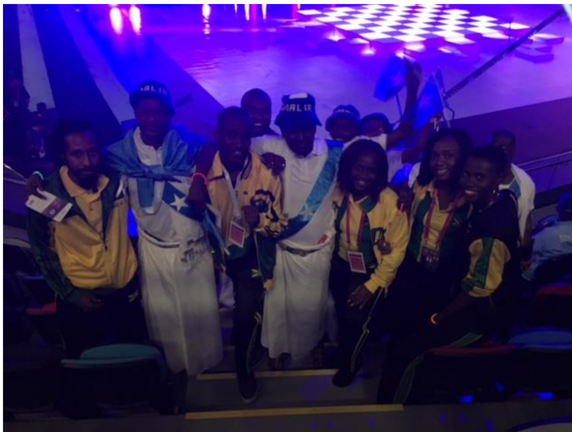
Jamaica and Somalia at the opening ceremony.