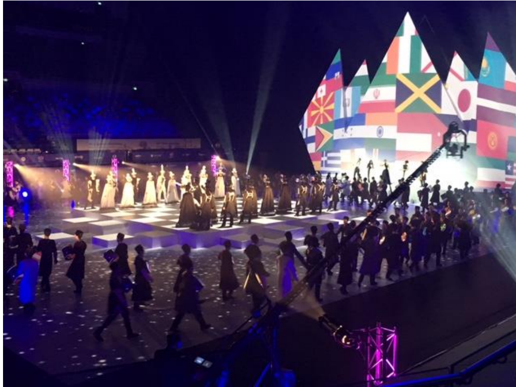
Performers and flags of various countries - See Jamaica's!

Members of the Jamaican delegation were resplendent in their national colours ( black, gold and green ) with the players from Somalia giving serious competition for “ best dressed delegation ” in their blue and white regalia complete with hats! Both groups took photographs together.