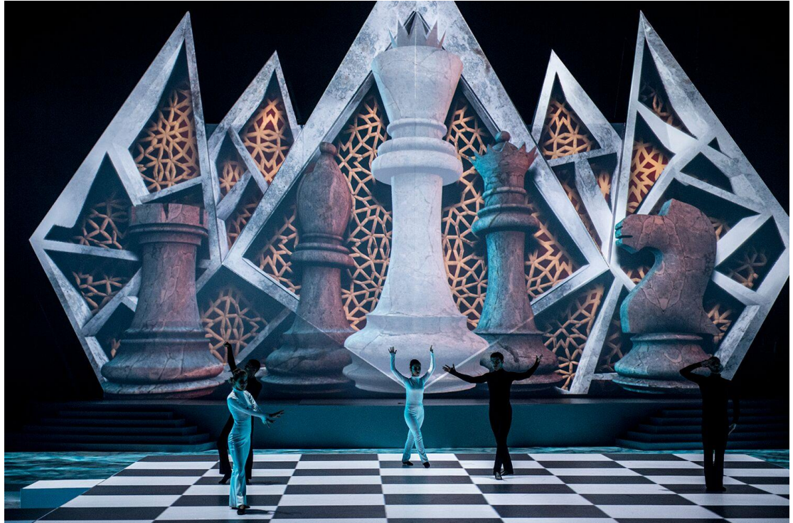
Majestic pieces