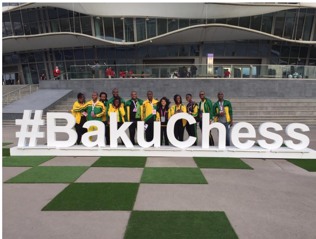
Jamaicans outside the venue before the opening ceremony.