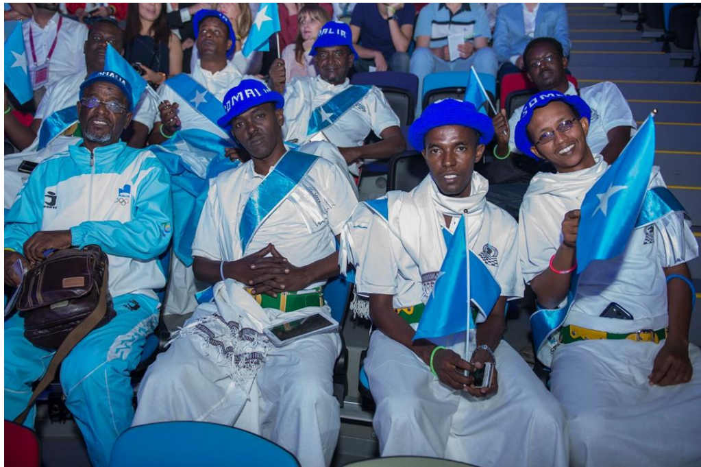
Somalia looking regal