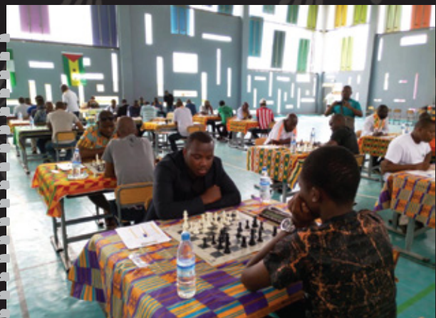
2017 Cote D'ivoire Teams invitational Tournament with players from Togo, Ghana, Nigeria, Liberia, Sao Tome, Burkina Faso