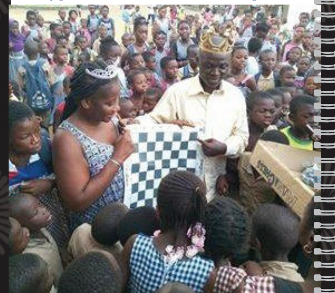
Over 2500 learners in Cote D'ivoire Chess in Schools Program

Corporate sponsorship from Vivendi including 15000$ Cash prizes, participants flights, 5-star accomodation and international broadcasting