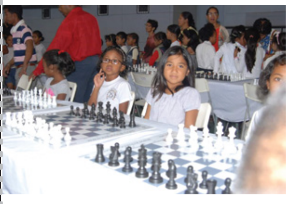
Chess is identified as a powerful educational tool in Madagascar with over 2000 learners