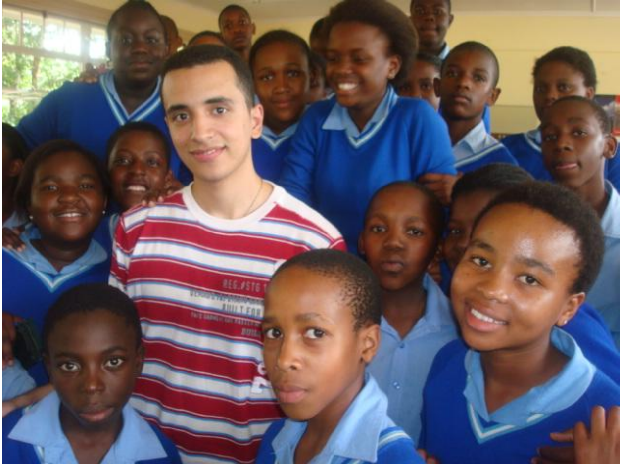
(Pupils and their Master! – Keeping hope alive!)