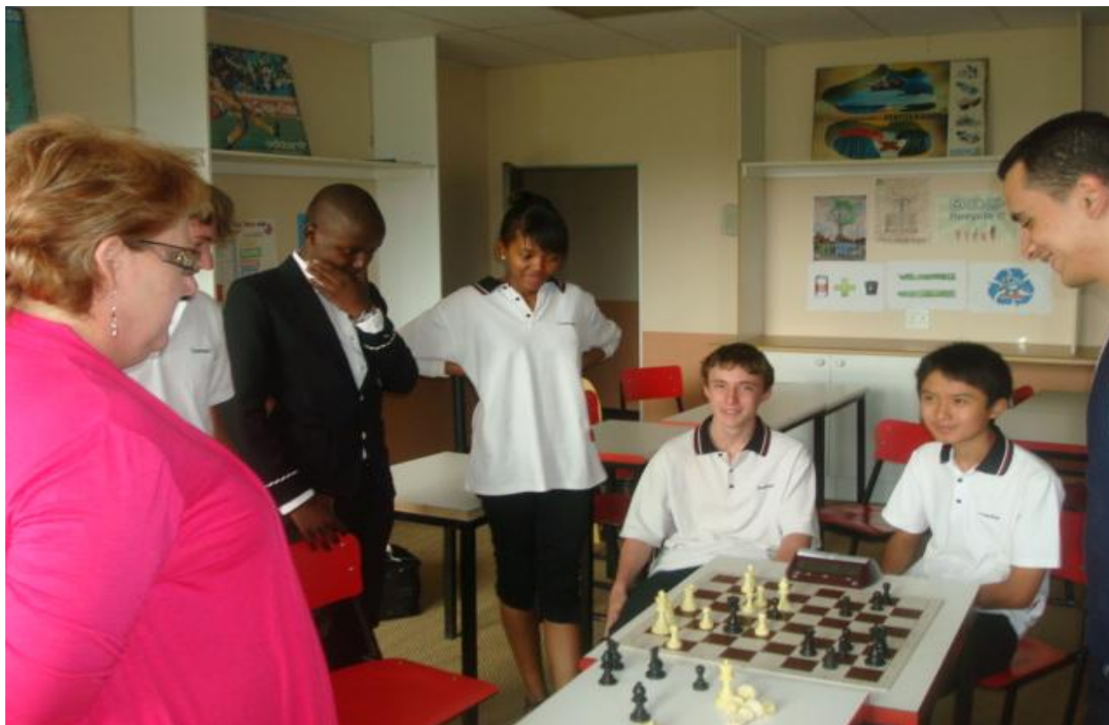
(Some game position analysis)